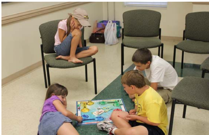
Winding down after a stint on the mic at FD.

2011 has really been the “Year of the TARC Kids” as they made their presence known in most everything we did.