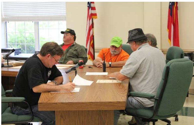
VE Session at Field Day

It's already in discussion to do this again, as most people walking through asked when we'd do it again. There is still gear left from last year, so we'll be looking for a nice spring Saturday to get set up and work on growing this event.